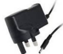
UK Power Supplier