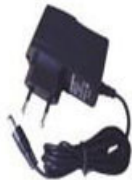
EU Power Supplier