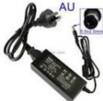
AU Power Supplier