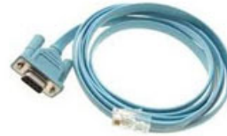
RJ45 to DB9 Cable