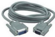
DB15 to DB9 Cable