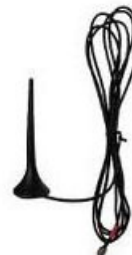
Rubber Magnetic-Mount W/ Cable