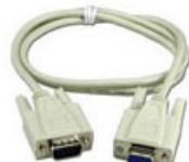
DB9 serial cable