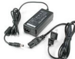
Desktop Power Supplier EU, US, AU, UK for choice