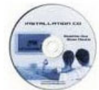
CD-Rom with Manual/Data