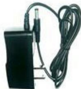
US Power Supplier